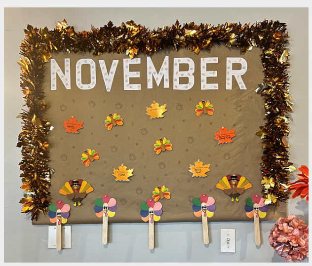
AFH provide activities for residents that wish to participate. This fun board was created leading up to Thanksgiving.

OCWCOG oversees the licensing of all AFHs in Linn, Benton, and Lincoln Counties and works with AFH providers to help them be successful. Providers offer a range of support to their residents, from basic medication management to full assistance in all activities of daily living, based on three different