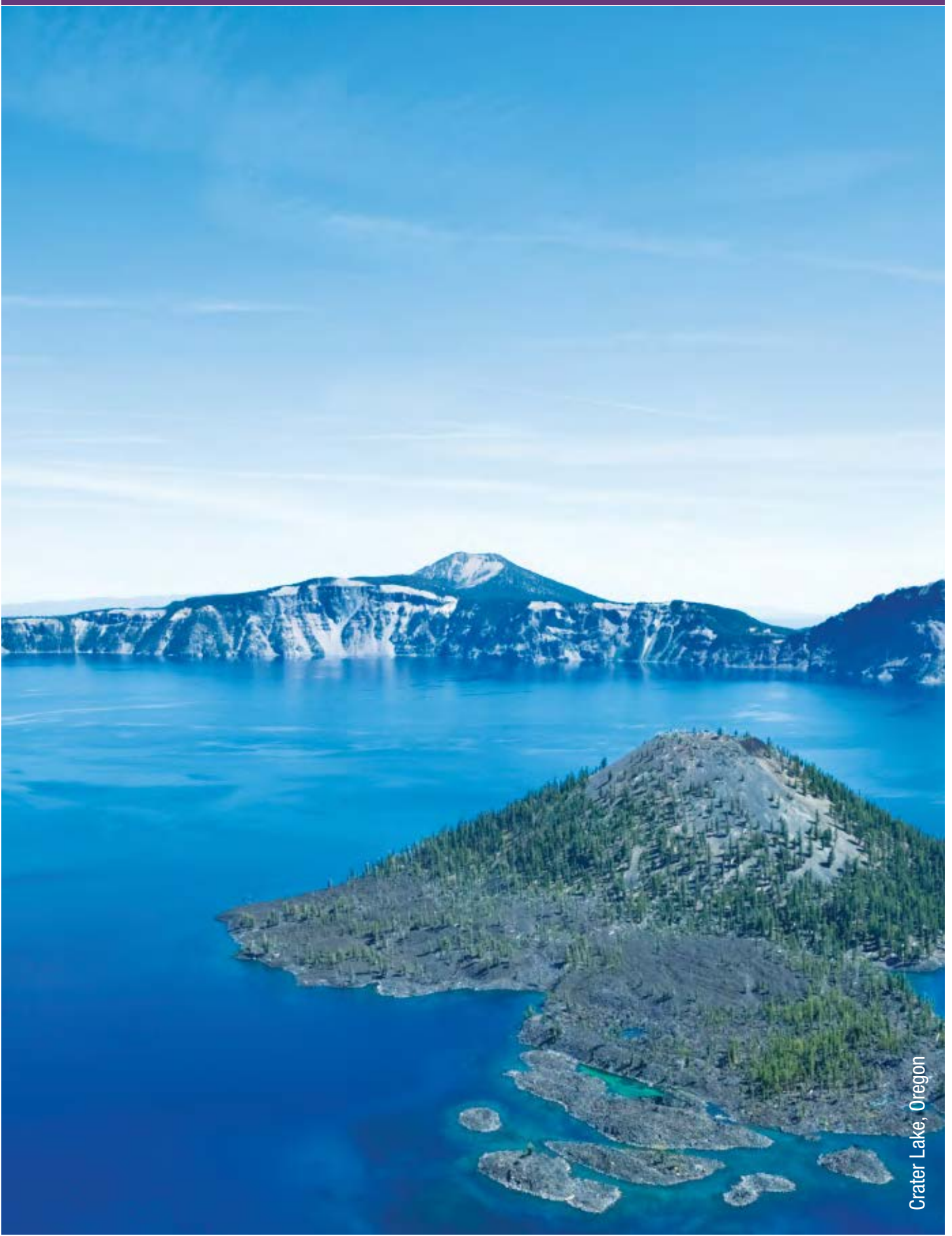
Crater Lake, Oregon