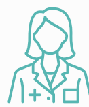
Combines parts A and B Available with or without prescription coverage (Part D)