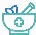
Medicare Part D Prescription drug plan (PDP)