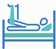
Part A Hospital insurance