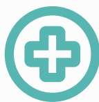
Medicare supplement insurance (Medigap/secondary insurance)