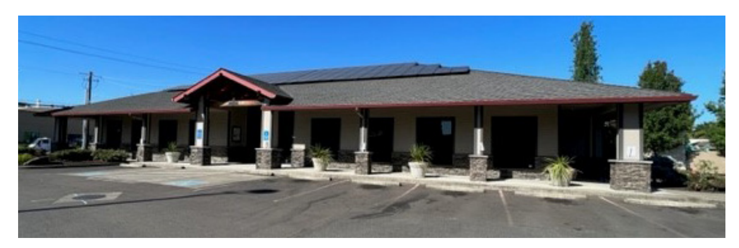
The new Corvallis building is located at located at 1121 NW Ninth Street.

2023 brought us the purchase of our new Corvallis office location, allowing us to have a permanent footprint in Benton County. The office houses staff dedicated to Senior and Disability Services, Community Service Programs, the Corvallis Area Metropolitan Planning Organization (CAMPO), and the Benton County Veteran Service Office. Like our other offices in Linn and Lincoln Counties, the new location is poised to become a hub of resources, information, and assistance that caters to the diverse needs of veterans, seniors, individuals, and families throughout the region.